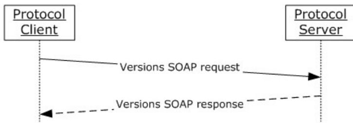
Figure 1: Versions SOAP sequence