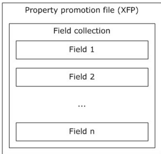
Figure 3: Structure of the property promotion format

The properties.xfp file is an XML file, as specified in [XML] , and is placed in the document library. The file specifies the field mappings from a source XML file to a set of destination fields. The properties.xfp file specifies properties including type, name and visibility. The structure of the properties.xfp file is as follows.